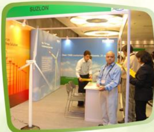
Exhibit Space Charges (on first-come-first serve basis)

Accompanying spouse programme will be a star attraction.