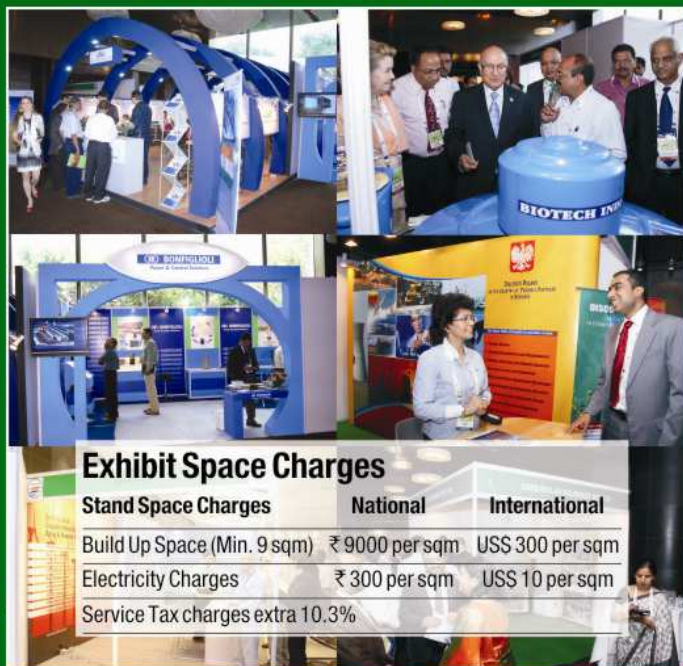
Exhibit Space Charges

Exhibitor can be accommodated on first-cum-first serve basis.